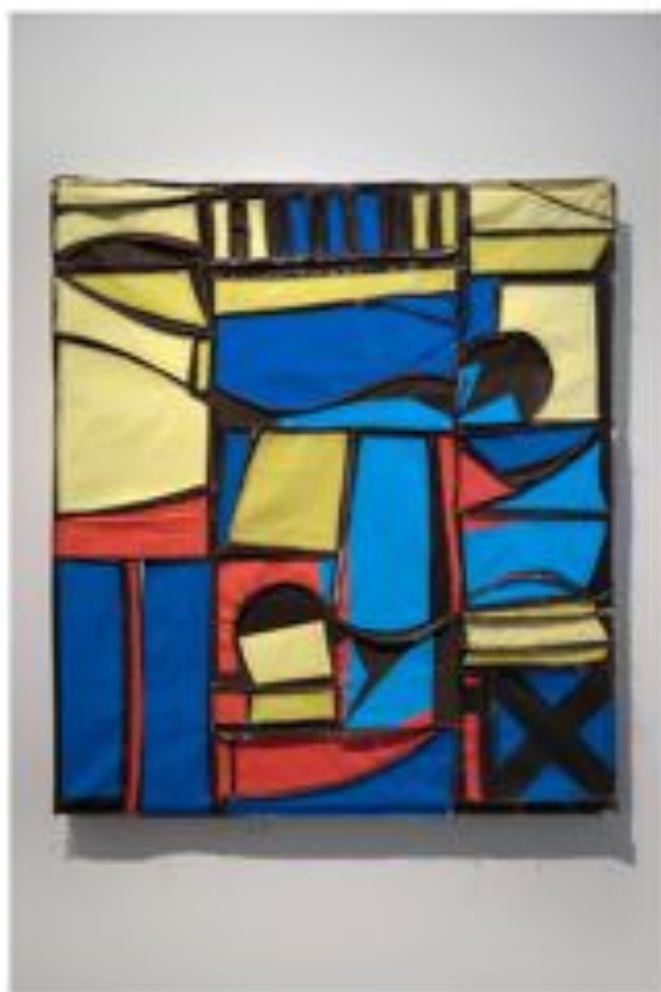
THE OLDE KING