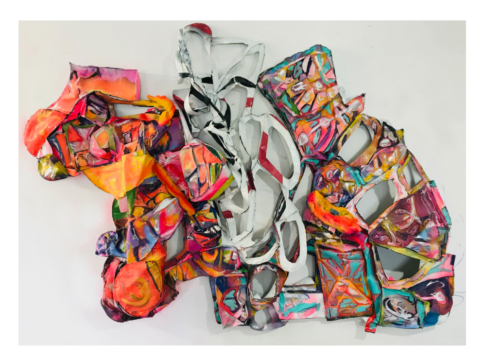
She Dances Across The Water, 2019 Billaboard Vinyl, acrylic paint, nylon thread, polyester 53 x 78 x 9 in. $12,000