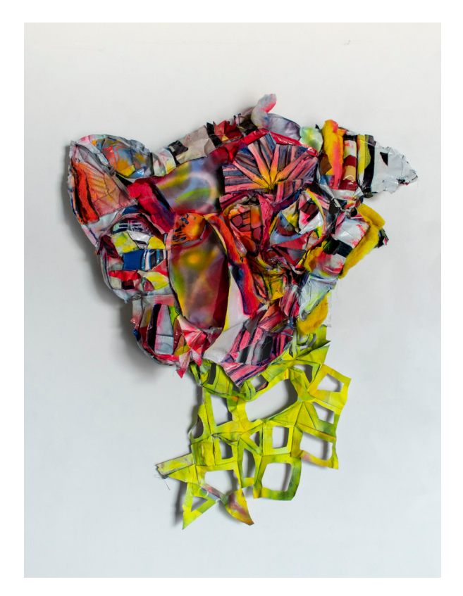
Tiger's Milk, 2019 Billaboard, Vinyl, acrylic paint, nylon thread, polyester 53 x 47 x 9. $6,800