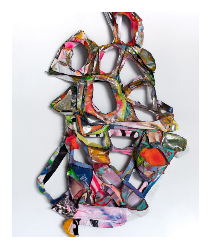
Begin with an Ending, 2019 Billaboard, Vinyl, acrylic paint, nylon thread, polyester 66 x 43 x 5 in. $6,800