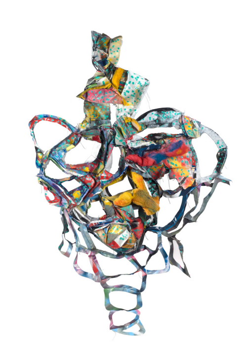
Private Screening, 2019 Billaboard, Vinyl, acrylic paint, nylon thread, polyester 66 x 46 x 8 in. $6,800